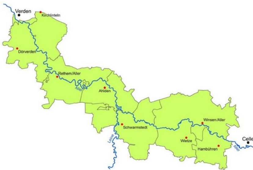
Figure 1: Regional cooperation Aller-Leine Valley. REK 2022: 11

The Aller-Leine Valley is characterized by a vibrant community life and strong voluntary commitment. Many local actors have been involved in the regional development to drive forward the energy transition for a long time, and engage in local networks (REK 2022: 7; Interviews no. 1-7). In this context, citizens, farmers, representatives from the business sector, nature conservation, politics and administration have jointly implemented numerous projects.