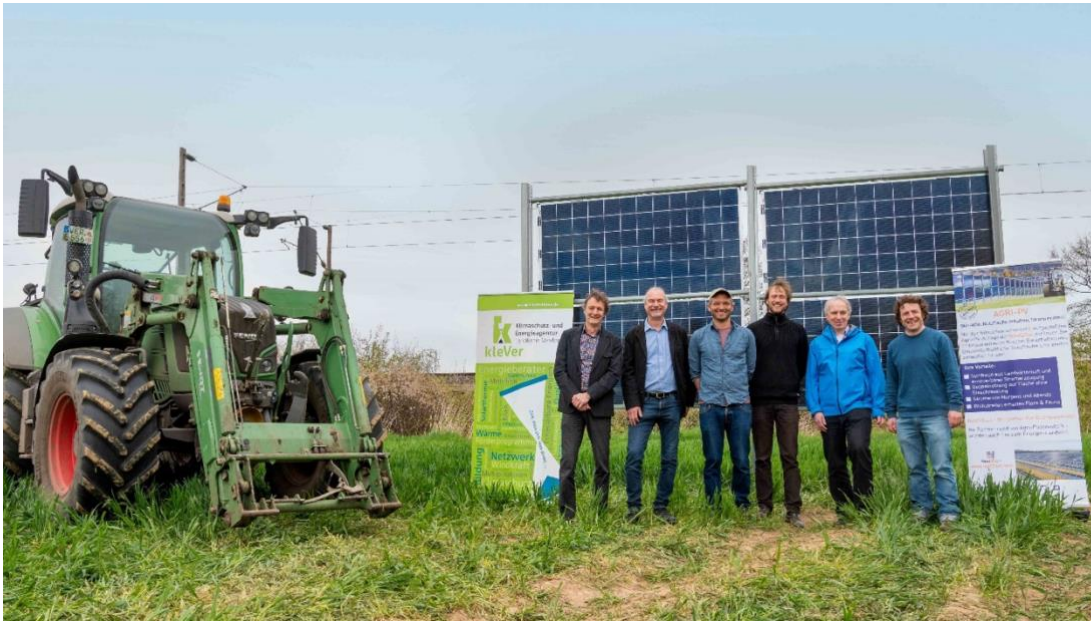
Figure 3: Agri-PV Model project, kick-off, April 2022.

construction of a free-standing agri-photovoltaic plant in the municipality of Dörverden that will test new solutions for agricultural use and photovoltaics, using bi-faciale modules (as first project in Lower Saxony) and experimenting with the cultivation of different crops in between. Instead of competing for land, Agri-PV aims to strategically combine climate goals and agricultural land use. The land is to be cultivated organically and various organic farmers from the municipality have agreed to cooperate, thus a diverse cultivation can be tested during the pilot phase. Since it is the first project also in Germany to implement organic farming between the rows of photovoltaic modules, it is expected to set an example and to develop impact for future projects of Agri-PV. The project will provide important knowledge on innovative agricultural land use methods for local communities and farmers, as well as accompanying scientists, who advise on organic farming and technology.